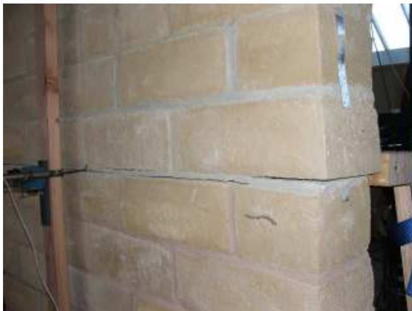
Figure 3: Horizontal crack under large lateral deflection

The wall remained intact at the large lateral deflections. Figure 3 shows a horizontal crack at mid height opposite the loading beam.