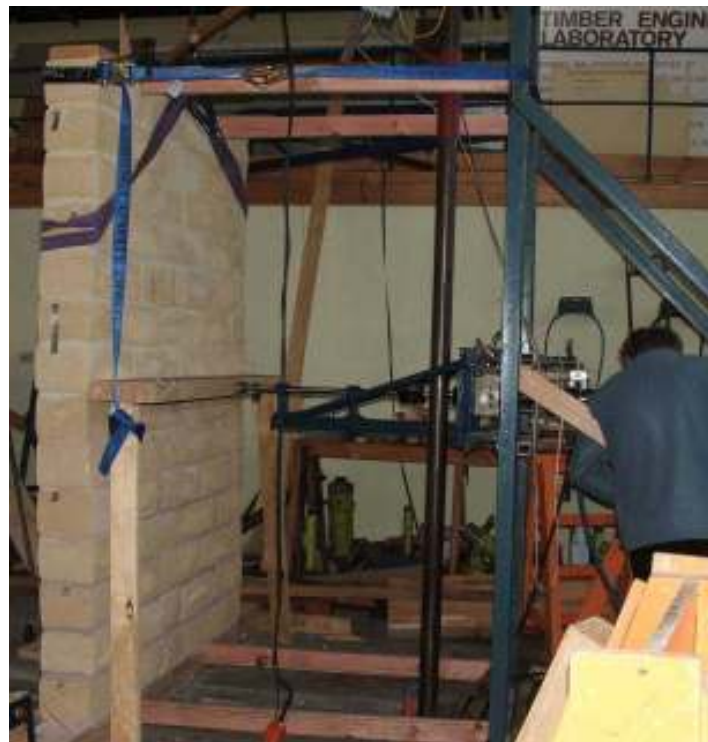
Figure 1: Timber Engineering Lateral Load wall Test Setup