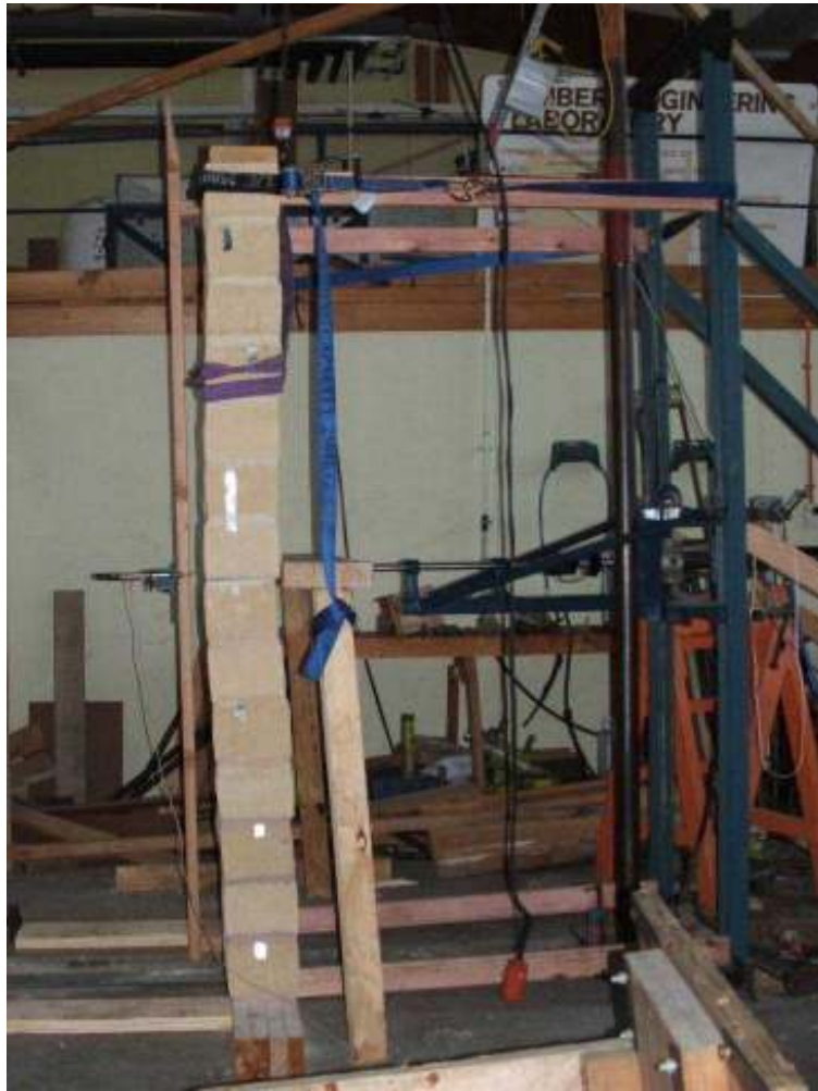
Figure 4: Overall Lateral Deflection

Figure 4 shows the large lateral deflection applied.